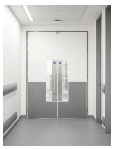
Antimicrobial copper door furniture installed at Francis Crick Institute.

The prestigious Francis Crick Institute research facility, in the heart of London's Knowledge Quarter, has antimicrobial copper door furniture throughout its laboratory and high-traffic areas, including auditorium doors in the visitor area. In addition, antimicrobial copper handles and bathroom turns have been used for WC doors and storage cupboards throughout the building.